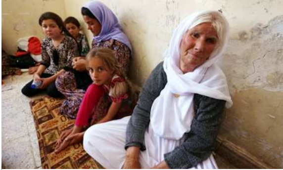
An Iraqi Yazidi family that fled the violence in Sinjar take shelter at a school in the Kurdish city of Dohuk.

Slavery and rape are being used as weapons of war by Isis against Yazidi and Christian women, yet rights activists are silent