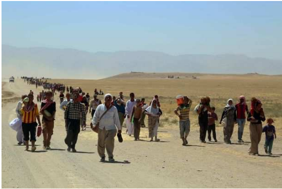
On the run: Thousands of Yazidis escape from Islamic State forces

Iraq's human rights minister, Mohammed Shia al-Sudani, claims there is undeniable evidence that Islamic gangs have executed at least 500 Yazidis