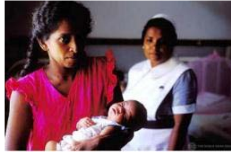
Woman with newborn child in post-natal ward of hospital, Sri Lanka.

At the International Association for Feminist Economics conference, social scientists, researchers and economists agree that women's work is still undervalued globally, and dogged by an enduring subconscious colonial mindset.