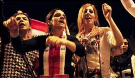
People shout slogans during a demonstration against corruption, poor services and power cuts in Baghdad, Iraq