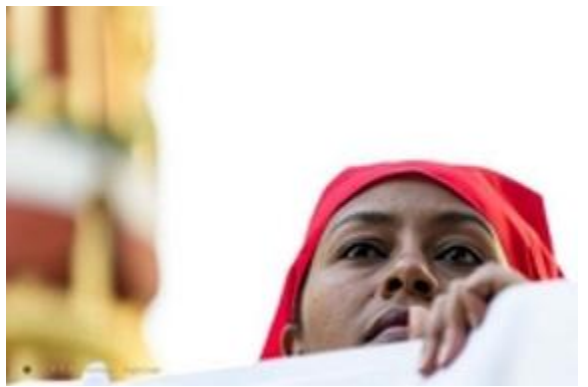
A demonstration for migrants' rights in Lausanne, Switzerland in Iune 2014

"Political platforms using security discourse to stop mafia organisations have actually strengthened human trafficking networks, which are now turning to women and children. If a woman has full access to her rights she will not need to turn to these trafficking networks," according to migrant and human trafficking researcher Helena Maleno Garzón. The intersections of racism, sexism and and violence create entrenched problems for migrant women in North Africa.