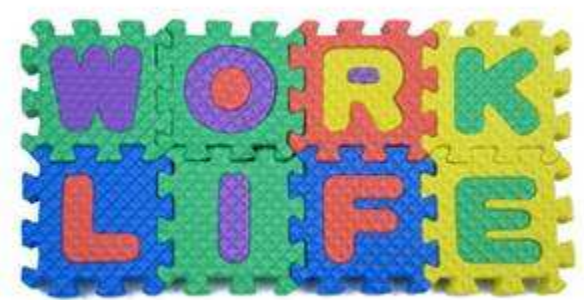
A balanced work and private life is important for a healthy workplace.

Research shows that employees with higher levels of work-family conflict suffer up to 12 times more often from burnout and can experience up to three times more depression or other psychological problems as workers with a better work-life balance.