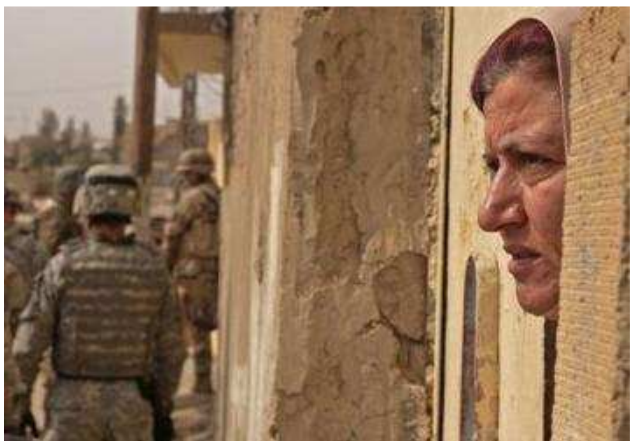
Iraqi woman watches from the gates of her home in Mosul in 2008

"The situation is horrific for women in Mosul," says the president of the Baghdad-based Organization of Women's Freedom in Iraq. Women "are being kidnapped from their house by the ISIS warriors and forced into what they call into a 'jihad marriage.'"