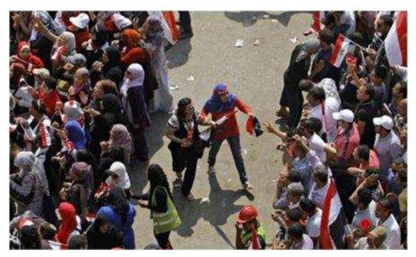
Volunteers form a safe zone between men and women to prevent sexual harassment during a protest in Tahrir Square in Cairo, Egypt.

Egypt has criminalised sexual harassment for the first time, in a move that campaigners say is just the first step towards ending an endemic problem.