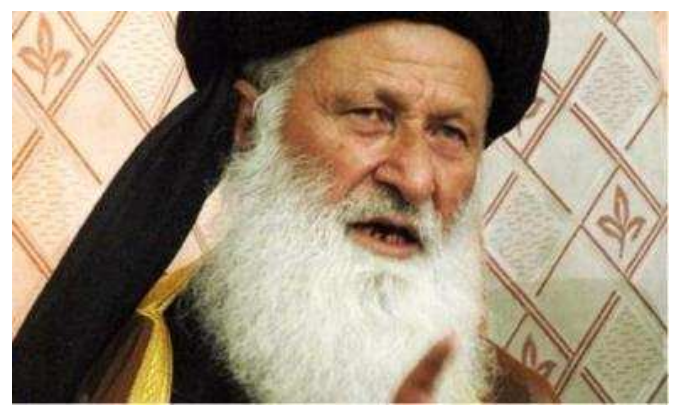
Maulana Mohammad Khan Sheerani, chairman of the Council of Islamic Ideology

ISLAMABAD: Amid criticism from various quarters, including some of its own members, the Council of Islamic Ideology (CII), on Wednesday endorsed its earlier ruling that girls as young as nine years old were eligible to be married, "if the signs of puberty are visible".