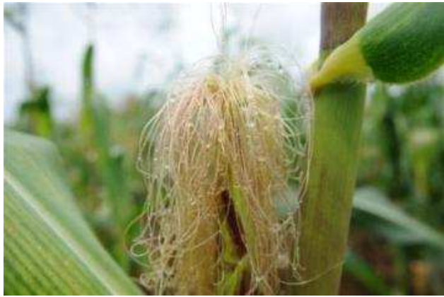
Women account for about 20 perscent of farmers tilling their own land in Zimbabwe

The spike in women managing their own agricultural land following Zimbabwe's 2000 land reform programme catapulted the country to high up in the African league of female farmers tilling their own farms, although accurate data for gendered land ownership on the continent remains a grey and contested area.