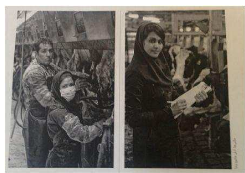
Pages from the new issue of the Iranian magazine Zanan-e Emruz

After being shut down by hardliners in 2008 the May 29 revival of this 16-year-old feminist publication is an event to celebrate as a defining moment for the resurgence of women's rights in the post-Ahmadinejad era.