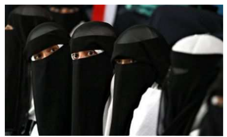
Schoolgirls in Sana'a, Yemen. A new law promises to protect under-18s from marriage.

Yemen is poised to vote on a comprehensive Child Rights Act over the coming months, which would ban child marriage and female genital mutilation (FGM).