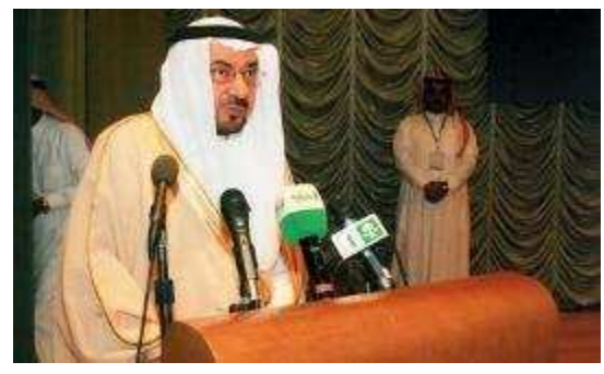
JIDDAH, Saudi Arabia: The secretary-general of the world's largest bloc of Islamic countries says the kidnapping of more than 270 Nigerian schoolgirls is a "barbaric" and "inhumane" act.

The secretary-general of the world's largest bloc of Islamic countries says the kidnapping of more than 270 Nigerian schoolgirls is a "barbaric" and "inhumane" act.