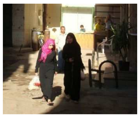
Teenage girls in low-income areas of Egypt are vulnerable to trafficking.

Each summer, wealthy male tourists from Gulf Arab states flock to Egypt to escape the oppressive heat of the Arabian Peninsula, taking residence at upscale hotels and rented flats in Cairo and Alexandria. Many come with their families and housekeeping staff, spending their days by the pool, shopping, and frequenting cafes and nightclubs. Others come for a more sinister purpose.