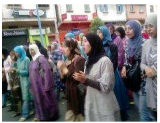
Women protest on the streets of Rabat to demand equal rights.

Morocco stands divided over a proposal for equal inheritance rights for men and women: modernists see this as application of equality arising from the new constitution, and Islamists see in this a violation of Sharia law.