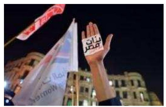
An Egyptian protester hold up his hand with a slogan reading in Arabic: "Egyptian girls are a red line" during a demonstration in Cairo against sexual harassment on February 2013

The new amendments to the Penal Code regarding sexual harassment are an "important yet insufficient step in fighting harassment", said Fatma Khafagy, Director Ombudswoman for Gender Equality at the National Council for Women (NCW).