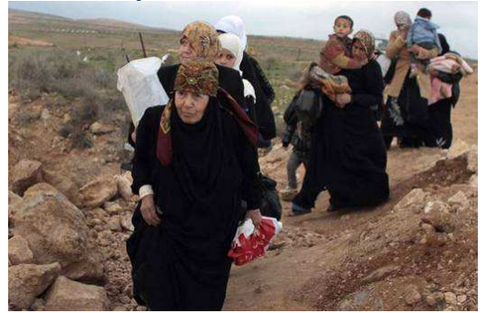
A line of Syrian refugee women, some carrying children, cross into Jordan from southern Syria.

4 December 2013 – Syrian refugee women have a key role to play in shaping the future of their war-torn homeland, the protection chief of the United Nations refugee agency (UNHCR) told a conference in London today.