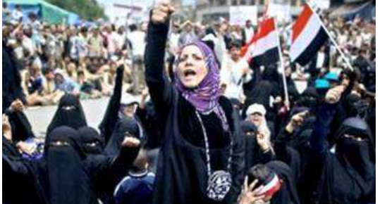
Since the 2011 Arab Spring, Yemeni women have gained political rights, but some say they are not enough

In order to ensure the effectiveness of the quota system, it is necessary for Yemen's government to ensure that that there are strong enforcement mechanisms in place that require a set number of women in the country's legislature, as the law explains.