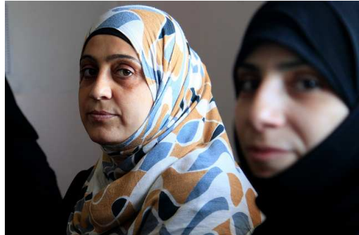
Syrian refugee women attending a counseling session in northern Jordan. Syrian women's groups want full representation at the Geneva II peace talks in January 2014.

Recognizing that women in the Middle East and North Africa must play an active role in their countries' political processes, especially amid the regional backdrop of upheavals and conflicts, the Netherlands government is providing money for a new program, Women on the Frontline, to help women-run initiatives organize themselves better to assert their rights to equal civic participation. One such prominent effort is a push for the participation of Syrian women's groups in the Geneva II peace negotiations between President Bashar al-Assad and the opposition, scheduled by the United Nations for Jan. 22. Achieving that goal is shared by a global network of women's groups representing thousands of activists, but they are meeting tough resistance.