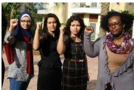
WELDD feminist leadership training participants show their power, Cairo 2013

Women's Resource Centre, the Institute for Women's Empowerment (IWE), and Women Living Under Muslim Laws (WLUML) have today announced the launch of a new feminist leadership web portal as part of their Women's Empowerment and Leadership Development for Democratization (WELDD) program. The portal will act as a virtual pathway to feminist activists, organizations, and dreamers of a gender-just and egalitarian world. The portal is a space to share useful resources, a forum for sharing experiences and holding discussions and debates about how to nurture feminist leadership that is transformative and sustainable. WELDD is committed to Global South knowledge production, and will hold a space for theoretical/conceptual explorations emerging from Muslim majority contexts in Arabic, Bahasa, English, French and Urdu.