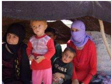
Iraqi refugees finding safety in Dohok in August 2014 in the semiautonomous region of Kurdistan during the siege by the extremist group called Islamic State of Iraq and Syria. The refugees had fled Shangal, in the region.