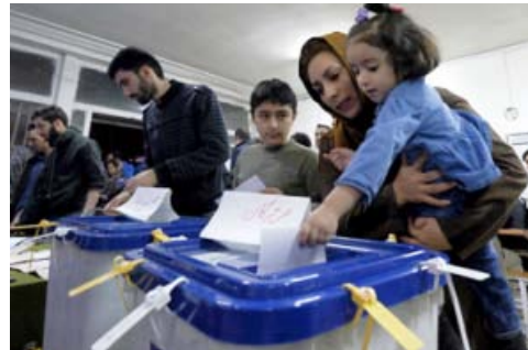
An Iranian woman holding her daughter casts her ballot during elections in Tehran

The new Iranian parliament will see more women than clerics, whose number have reached an all-time low, parliamentary elections results have shown. This is the first time women have outnumbered clerics in the country's history.