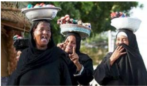
Nubian women sell traditional handicrafts at the Nubian Gharb Suheil village, near Aswan

CAIRO — Some Nubian women have left their region's villages to make their own way, either by completing their studies or seeking out new job opportunities, and have succeeded in integrating into the world outside their societies. Others remain constrained by Nubia's traditional mores and customs. Still others have gradually moved away from those traditions. Nevertheless, the bonds of marriage continue to stand, as families insist that Nubian women marry Nubian men in order to preserve the Nubian heritage throughout their lives, according to accounts given by Nubian girls to Al-Monitor.