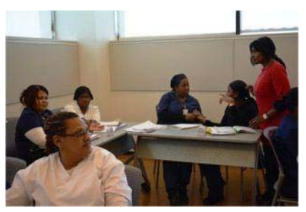
At Cooperative Home Care Associates, in their state of the art training facilities, these workers in training are finding each other's pulses with the help of their training instructor

Co-ops not only give low-income and immigrant women a way to enter an often unwelcoming – and in some cases, hostile – economy, but also give them a way to exert some control over their work lives and simultaneously support themselves and their families. They have consequently been some of the early adopters in the not-yet-critical-mass movement of workerowned cooperative businesses that has begun to catch fire in towns and cities throughout the United States.