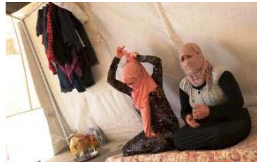
Yazidi sisters, who escaped from captivity by Islamic State militants, sit in a tent at Sharya refugee camp

I am thinking of the price list leaked out from the ISIS Sex Slave Market that included women and girls on the same list as cattle. ISIS needed to impose price controls as they were worried about a downturn in their market.